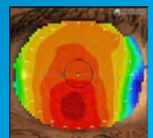
vs. Medmont Closed cone Placido 13 x 11mm